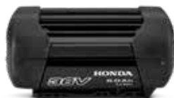
36V 6.0Ah DP3660XA