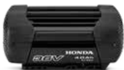
36V 4.0Ah DP3640XA

A selection of Honda universal Li-ion batteries for the cordless range.