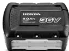
36V 9.0Ah DPW3690XA